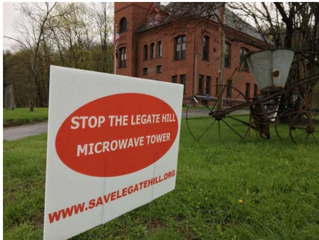
One of Hilltown Health's successful campaigns, Charlemont Town Hall is in the background.

Hilltown Health successfully negotiated a 1500' cell tower setback in neighboring Shelburne in 2021 (known for the artistic village of Shelburne Falls with its' Bridge of Flowers) and then in their hometown of Charlemont, worked successfully for municipally owned fiber to the home (2020) and then an updated cell tower by-law (2024) which includes a requirement for carriers to provide dropped call data to prove a gap in service. This dropped call data requirement may be enough to deter potential applicants who will never willingly provide it - time will tell.