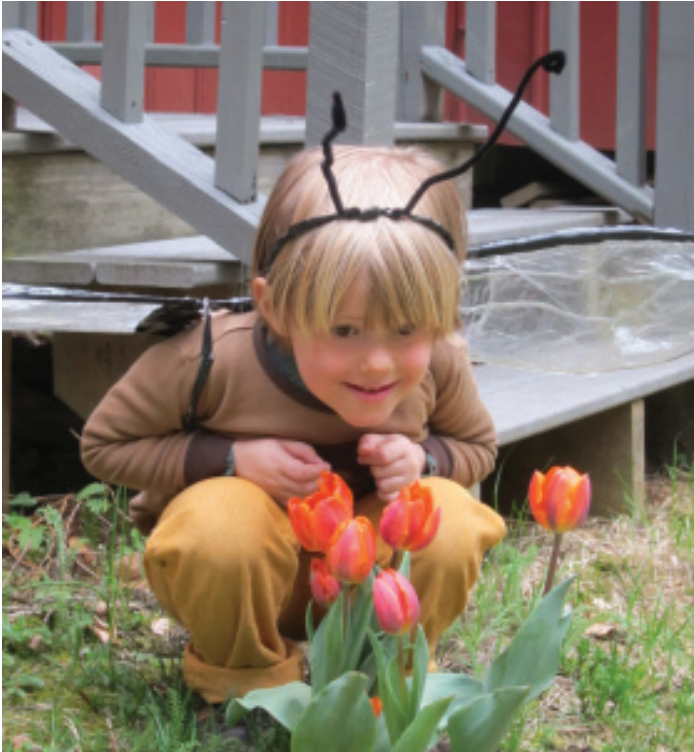
A young worker bee investigates nectar sources.

Outdoor time anyone? Piti Theatre, an award-winning theater troupe based in Charlemont will be launching Bee and Blossom, a program designed to encourage nature and arts exploration for ages 0 - 8 this fall. The venue is Piti's large barn and 34 acres of land on Avery Brook Road in Charlemont, seven minutes west of Shelburne Falls.